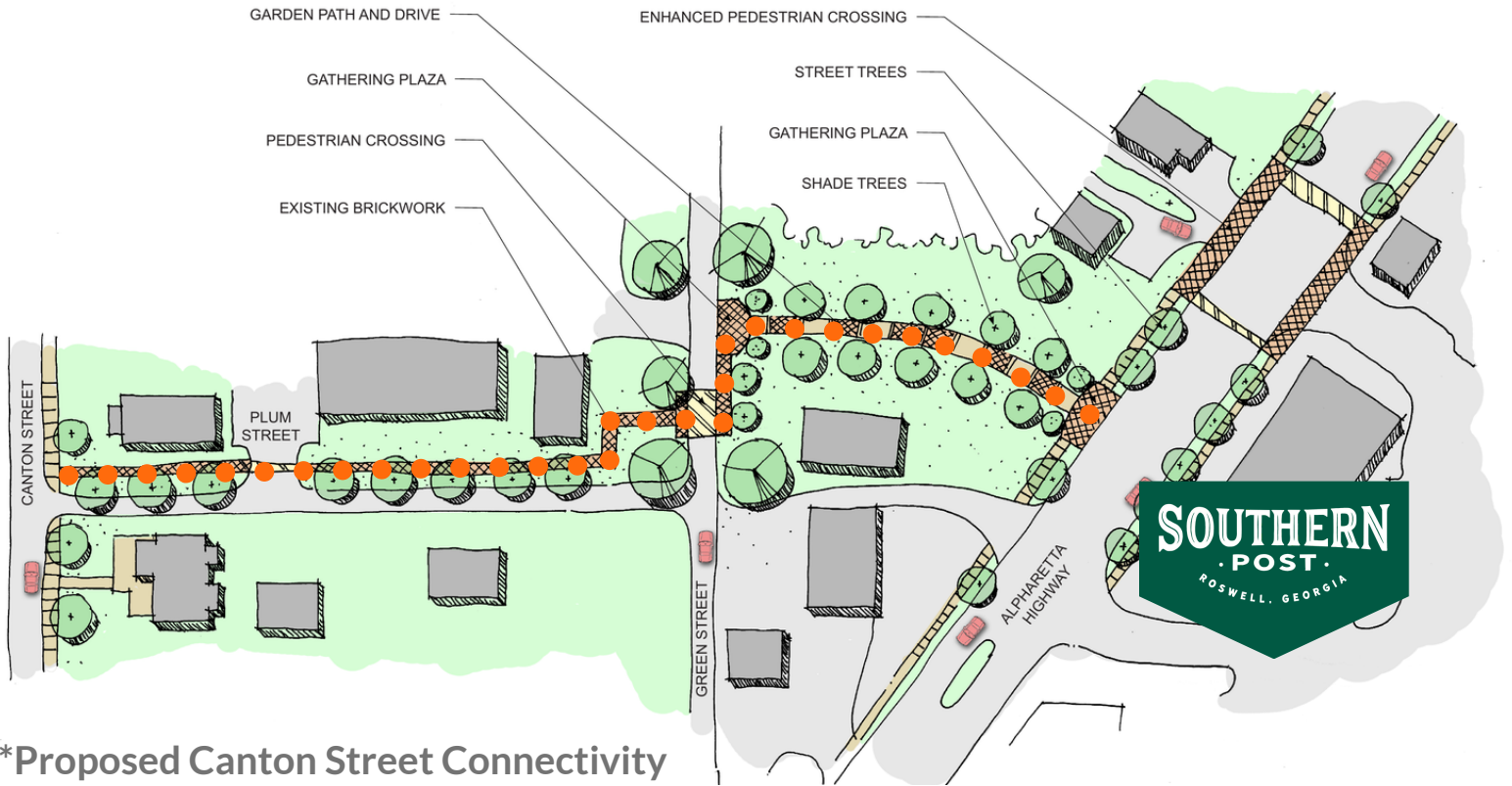
*Proposed Canton Street Connectivity